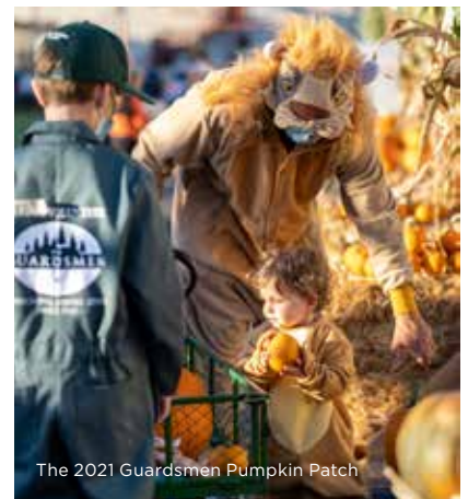
The 2021 Guardsmen Pumpkin Patch