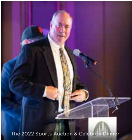
The 2022 Sports Auction & Celebrity Dinner

The Guardsmen was happy to be back connecting with the community through special events during the 2021-2022 fiscal year! Though some COVID-19 restrictions made event planning more unpredictable than usual, we were proud to fundraise for our programs through nine in-person public events, such as our Sports Auction & Celebrity Dinner , our San Francisco Wine Auction , our long-standing annual Tree Lot tradition, and our newer and increasingly popular outdoor Pumpkin Patch . With inflation affecting both our event expenses as well as the needs of our partner schools and camps, we appreciate all who supported our events in any way and helped us to continue to serve Bay Area kids from low-income households.