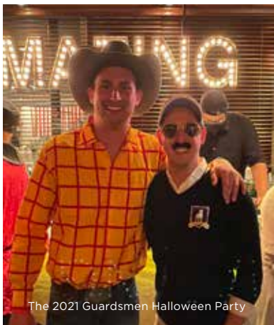
The 2021 Guardsmen Halloween Party