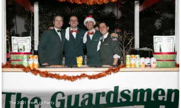
The 2021 Tree Lot Party