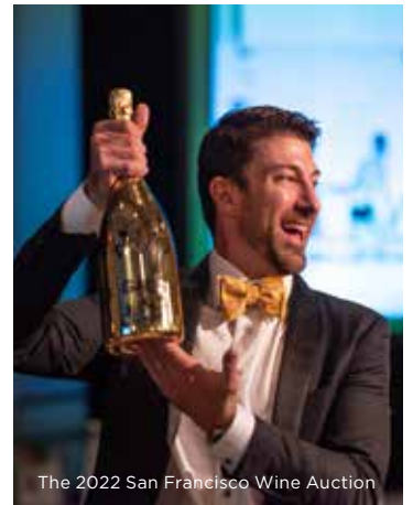
The 2022 San Francisco Wine Auction