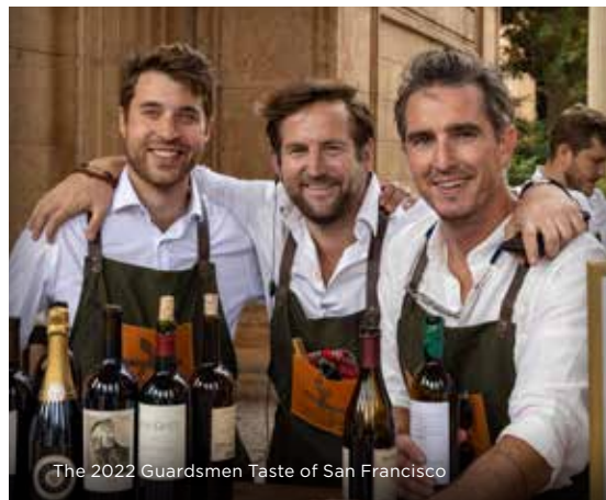
The 2022 Guardsmen Taste of San Francisco