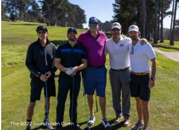
The 2022 Guardsmen Open