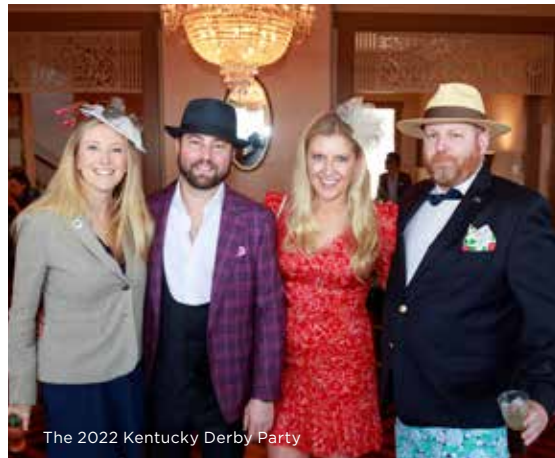
The 2022 Kentucky Derby Party